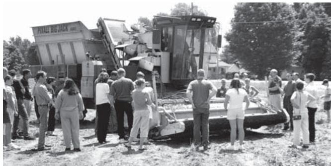
Group visits My-T-Acres bean harvest.