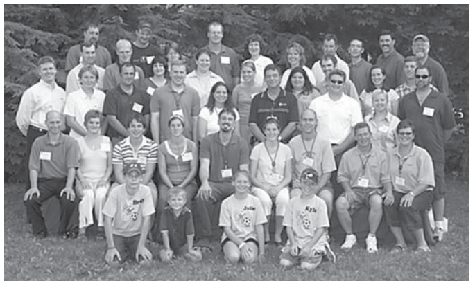
2005 Future Leaders Conference attendees.